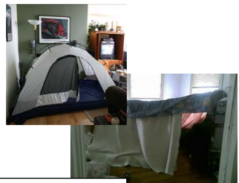
Camping Tent set up in the house