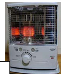
Kerosene Heaters or Propane Heaters

5. Other heat sources. The emergency cooking heat sources discussed for indoor use in Food , can be used to provide heat. Propane heaters approved for indoor use can also be used. Turn these off before going to sleep.