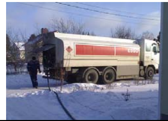
Fuel Delivery may be interrupted

The Problem: Heat may not be available. Critical infrastructure is at risk in a pandemic. This includes power generating plants, refineries for heating oil, natural gas facilities, coal mining, and transportation systems. The people who work at these facilities will also be sick.